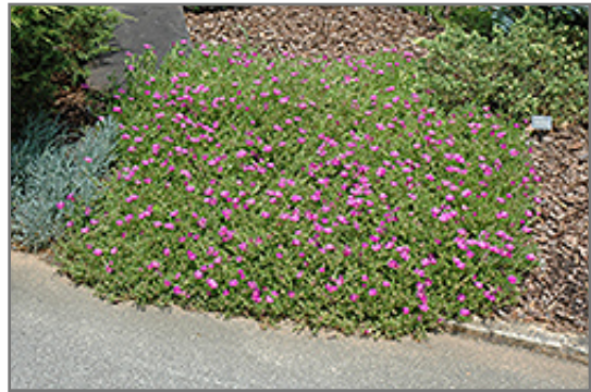
Purple Ice Plant in bloom

Purple Ice Plant will grow to be only 2 inches tall at maturity extending to 3 inches tall with the flowers, with a spread of 24 inches. Its foliage tends to remain low and dense right to the ground. It grows at a fast rate, and under ideal conditions can be expected to live for approximately 5 years. As an evergreen perennial, this plant will typically keep its form and foliage year-round.