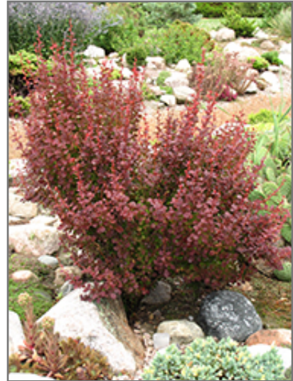
Orange Rocket Japanese Barberry

This shrub does best in full sun to partial shade. It is very adaptable to both dry and moist growing conditions, but will not tolerate any standing water. It is considered to be drought-tolerant, and thus makes an ideal choice for xeriscaping or the moisture-conserving landscape. It is not particular as to soil type or pH, and is able to handle environmental salt. It is highly tolerant of urban pollution and will even thrive in inner city environments. This is a selected variety of a species not originally from North America.