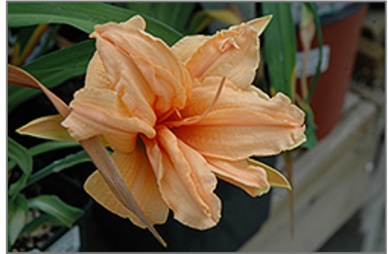
Vanilla Fluff Daylily flowers