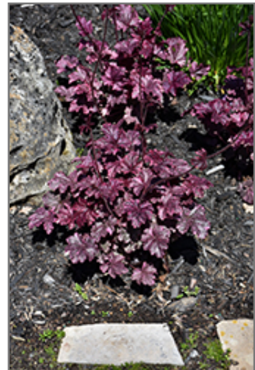
Midnight Rose Coral Bells