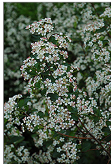
Black Chokeberry flowers