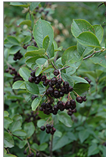
Black Chokeberry fruit