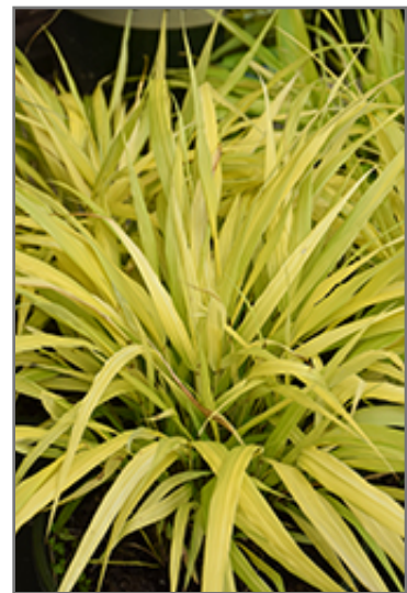
All Gold Hakone Grass foliage