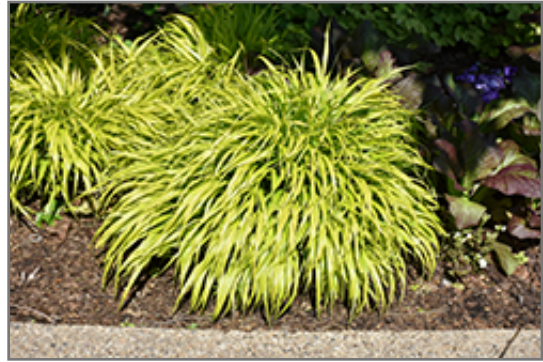
All Gold Hakone Grass