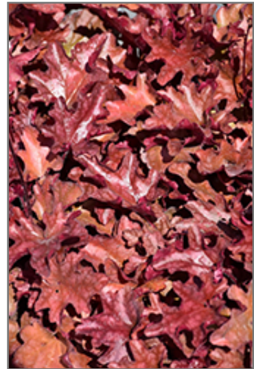
Peach Flambe Coral Bells foliage

This is a relatively low maintenance plant, and should be cut back in late fall in preparation for winter. It is a good choice for attracting hummingbirds to your yard. It has no significant negative characteristics.