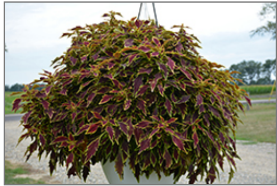
FlameThrower Serrano Coleus

FlameThrower Serrano Coleus will grow to be about 18 inches tall at maturity, with a spread of 16 inches. When grown in masses or used as a bedding plant, individual plants should be spaced approximately 15 inches apart. Although it's not a true annual, this fast-growing plant can be expected to behave as an annual in our climate if left outdoors over the winter, usually needing replacement the following year. As such, gardeners should take into consideration that it will perform differently than it would in its native habitat.