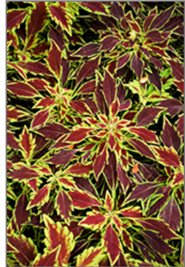
FlameThrower Serrano Coleus foliage

FlameThrower Serrano Coleus is recommended for the following landscape applications;