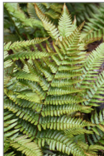
Autumn Fern foliage

Autumn Fern is recommended for the following landscape applications;