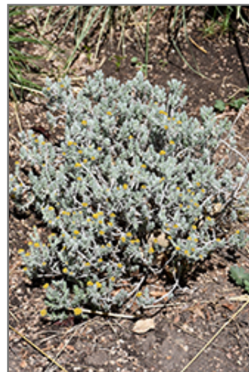
SteppeSuns Hokubetsi