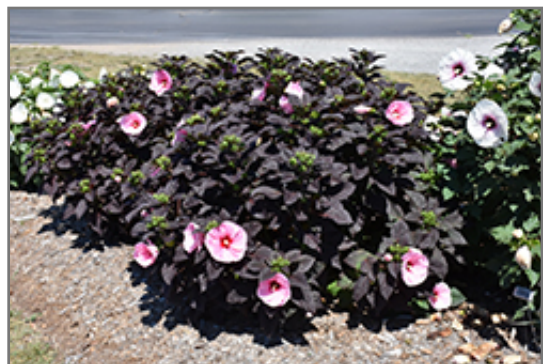
Summerific Edge of Night Hibiscus in bloom