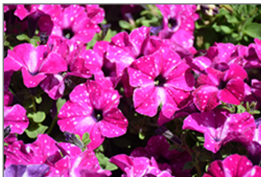
Headliner Enchanted Sky Petunia flowers