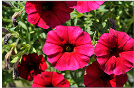
SuperCal Royal Red Petchoa flowers

SuperCal Royal Red Petchoa will grow to be about 12 inches tall at maturity, with a spread of 18 inches. When grown in masses or used as a bedding plant, individual plants should be spaced approximately 15 inches apart. Its foliage tends to remain dense right to the ground, not requiring facer plants in front. This fast-growing annual will normally live for one full growing season, needing replacement the following year.