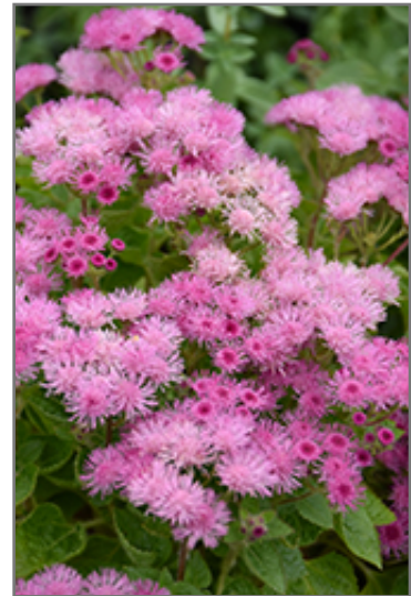
Bumble Rose Flossflower flowers

Bumble Rose Flossflower is recommended for the following landscape applications;