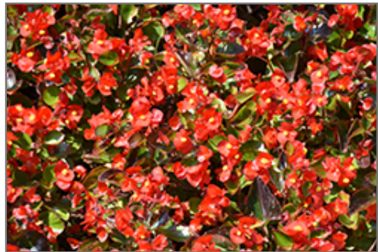
Ambassador Scarlet Begonia flowers