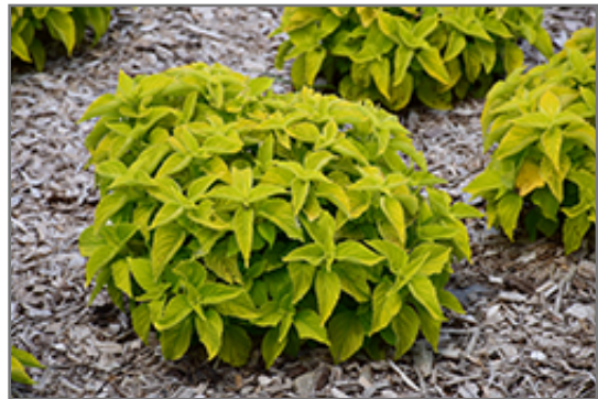
Chartres Street Coleus