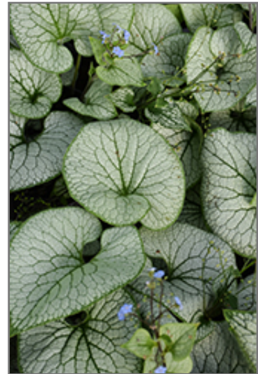
Sterling Silver Bugloss foliage

Sterling Silver Bugloss is a fine choice for the garden, but it is also a good selection for planting in outdoor pots and containers. It is often used as a 'filler' in the 'spiller-thriller-filler' container combination, providing a mass of flowers and foliage against which the thriller plants stand out. Note that when growing plants in outdoor containers and baskets, they may require more frequent waterings than they would in the yard or garden.