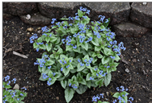
Sterling Silver Bugloss in bloom