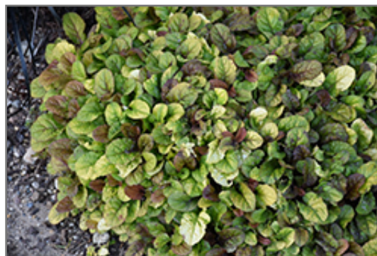
Feathered Friends Parrot Paradise Bugleweed