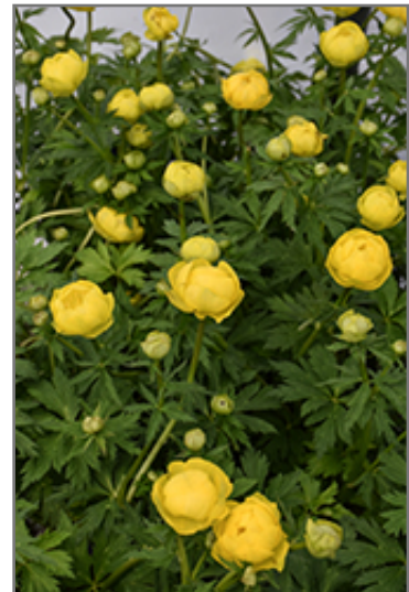
Lemon Queen Globeflower flowers