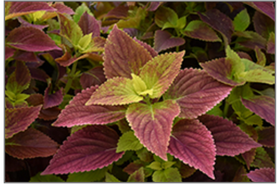
Alabama Sunset Coleus foliage