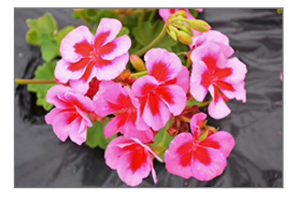
Calliope Large Rose Mega Splash Geranium flowers