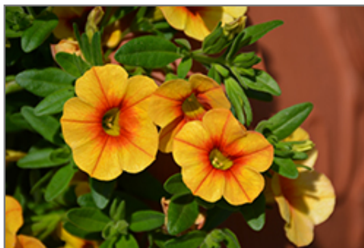
Calitastic Mango Calibrachoa flowers

Calitastic Mango Calibrachoa is recommended for the following landscape applications;