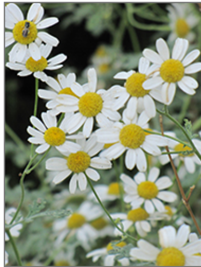
German Chamomile flowers