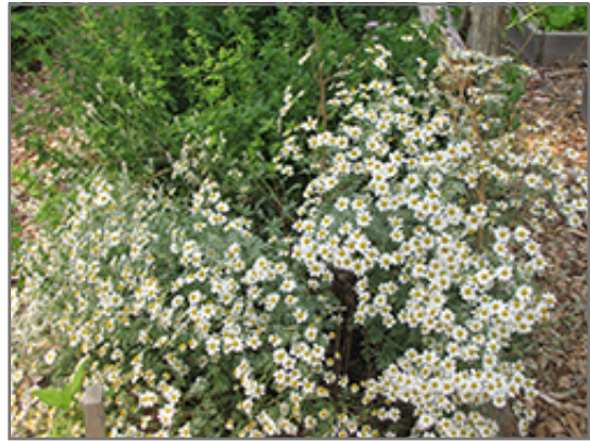
German Chamomile

This plant is quite ornamental as well as edible, and is as much at home in a landscape or flower garden as it is in a designated herb garden. It does best in full sun to partial shade. It is very adaptable to both dry and moist locations, and should do just fine under typical garden conditions. It is not particular as to soil type or pH. It is somewhat tolerant of urban pollution. This species is not originally from North America.