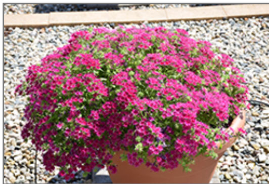
Popstars Purple Phlox in bloom