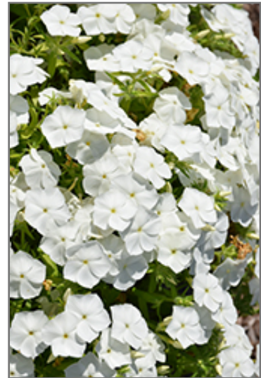
Gisele White Phlox flowers

Gisele White Phlox is recommended for the following landscape applications;