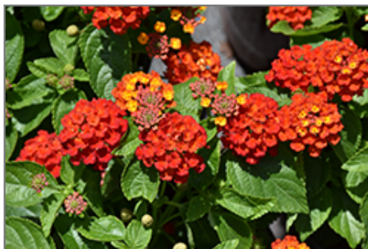
Hot Blooded Red Lantana flowers

This is a relatively low maintenance plant, and should not require much pruning, except when necessary, such as to remove dieback. It is a good choice for attracting butterflies and hummingbirds to your yard, but is not particularly attractive to deer who tend to leave it alone in favor of tastier treats. It has no significant negative characteristics.