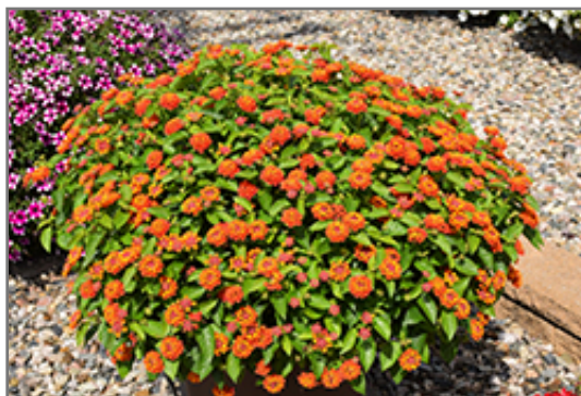
Hot Blooded Red Lantana in bloom

Hot Blooded Red Lantana is a fine choice for the garden, but it is also a good selection for planting in outdoor containers and hanging baskets. It is often used as a 'filler' in the 'spiller-thriller-filler' container combination, providing a mass of flowers against which the thriller plants stand out. Note that when growing plants in outdoor containers and baskets, they may require more frequent waterings than they would in the yard or garden.