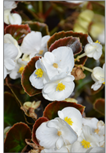
Senator IQ White flowers