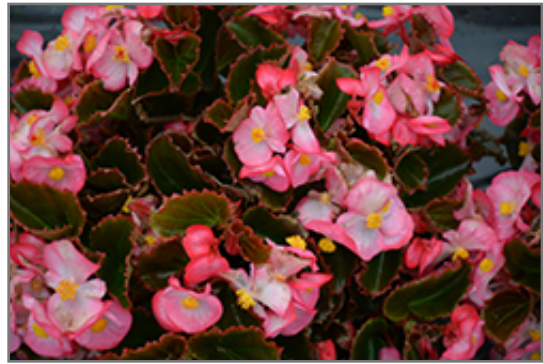
Senator IQ Rose Bicolor flowers