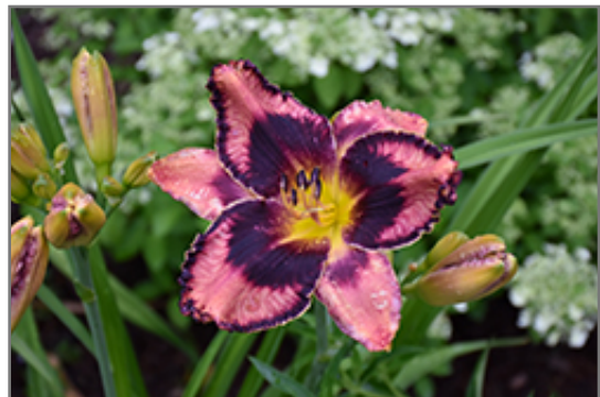
Rainbow Rhythm Storm Shelter Daylily flowers