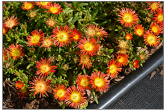
Delmara Red Ice Plant flowers

Delmara Red Ice Plant will grow to be only 4 inches tall at maturity extending to 6 inches tall with the flowers, with a spread of 15 inches. When grown in masses or used as a bedding plant, individual plants should be spaced approximately 12 inches apart. Its foliage tends to remain low and dense right to the ground. It grows at a fast rate, and under ideal conditions can be expected to live for approximately 5 years. As an evergreen perennial, this plant will typically keep its form and foliage year-round.