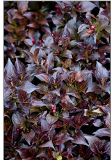
Coco Krunch Weigela foliage