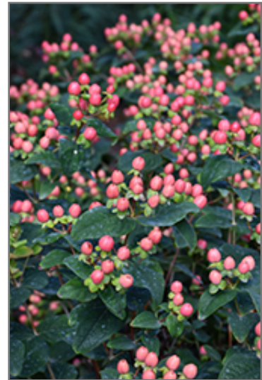
FloralBerry Rosé St. John's Wort fruit

FloralBerry Rosé St. John's Wort is recommended for the following landscape applications;