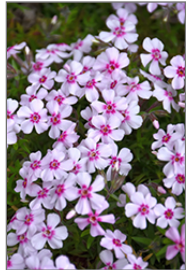
Coral Eye Moss Phlox flowers

Coral Eye Moss Phlox will grow to be only 4 inches tall at maturity, with a spread of 18 inches. When grown in masses or used as a bedding plant, individual plants should be spaced approximately 14 inches apart. Its foliage tends to remain low and dense right to the ground. It grows at a medium rate, and under ideal conditions can be expected to live for approximately 10 years. As an evergreen perennial, this plant will typically keep its form and foliage year-round.