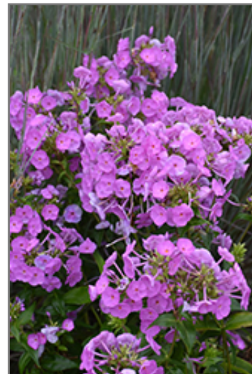
Fashionably Early Flamingo Garden Phlox flowers