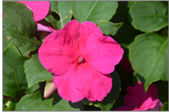
Accent Premium Rose Impatiens flowers

Accent Premium Rose Impatiens is recommended for the following landscape applications;