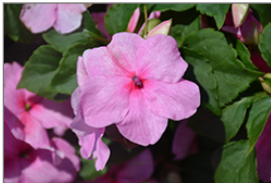
Accent Premium Pink Impatiens flowers

Accent Premium Pink Impatiens is recommended for the following landscape applications;