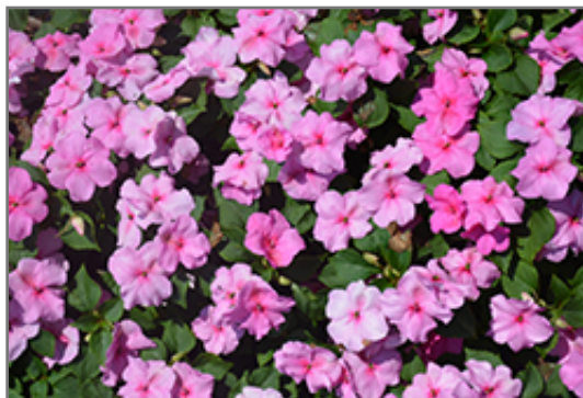
Accent Premium Pink Impatiens flowers