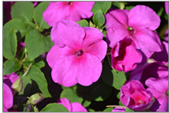
Accent Premium Lilac Impatiens flowers