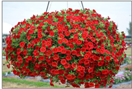
MiniFamous Neo Vampire Calibrachoa in bloom

MiniFamous Neo Vampire Calibrachoa is a fine choice for the garden, but it is also a good selection for planting in outdoor containers and hanging baskets. Because of its trailing habit of growth, it is ideally suited for use as a 'spiller' in the 'spiller-thriller-filler' container combination; plant it near the edges where it can spill gracefully over the pot. Note that when growing plants in outdoor containers and baskets, they may require more frequent waterings than they would in the yard or garden.