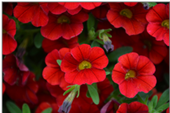
MiniFamous Neo Vampire Calibrachoa flowers

This plant will require occasional maintenance and upkeep. Trim off the flower heads after they fade and die to encourage more blooms late into the season. It is a good choice for attracting bees and hummingbirds to your yard, but is not particularly attractive to deer who tend to leave it alone in favor of tastier treats. It has no significant negative characteristics.