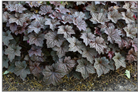
Palace Purple Coral Bells

Palace Purple Coral Bells is a fine choice for the garden, but it is also a good selection for planting in outdoor pots and containers. With its upright habit of growth, it is best suited for use as a 'thriller' in the 'spiller-thriller-filler' container combination; plant it near the center of the pot, surrounded by smaller plants and those that spill over the edges. Note that when growing plants in outdoor containers and baskets, they may require more frequent waterings than they would in the yard or garden.