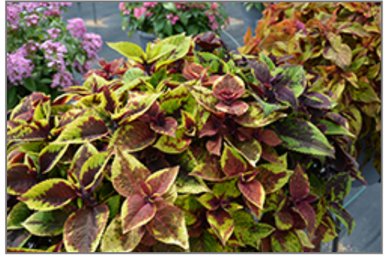
Premium Sun Pineapple Surprise Coleus

Premium Sun Pineapple Surprise Coleus will grow to be about 24 inches tall at maturity, with a spread of 20 inches. When grown in masses or used as a bedding plant, individual plants should be spaced approximately 18 inches apart. Although it's not a true annual, this fast-growing plant can be expected to behave as an annual in our climate if left outdoors over the winter, usually needing replacement the following year. As such, gardeners should take into consideration that it will perform differently than it would in its native habitat.