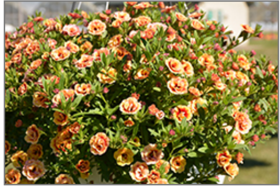
MiniFamous Double Orange Strike Calibrachoa in bloom

MiniFamous Double Orange Strike Calibrachoa is a fine choice for the garden, but it is also a good selection for planting in outdoor containers and hanging baskets. Because of its trailing habit of growth, it is ideally suited for use as a 'spiller' in the 'spiller-thriller-filler' container combination; plant it near the edges where it can spill gracefully over the pot. Note that when growing plants in outdoor containers and baskets, they may require more frequent waterings than they would in the yard or garden.