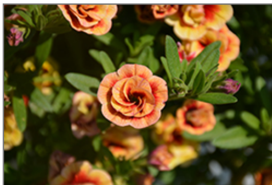
MiniFamous Double Orange Strike Calibrachoa flowers

This plant will require occasional maintenance and upkeep. Trim off the flower heads after they fade and die to encourage more blooms late into the season. It is a good choice for attracting bees and hummingbirds to your yard, but is not particularly attractive to deer who tend to leave it alone in favor of tastier treats. It has no significant negative characteristics.