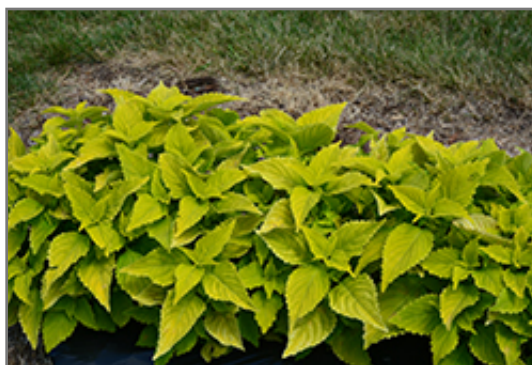
ColorBlaze Lime Time Coleus