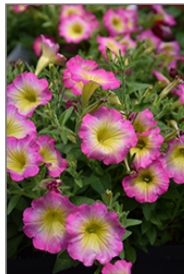
Supertunia Daybreak Charm Petunia flowers

Supertunia Daybreak Charm Petunia is a dense herbaceous annual with a trailing habit of growth, eventually spilling over the edges of hanging baskets and containers. Its medium texture blends into the garden, but can always be balanced by a couple of finer or coarser plants for an effective composition.