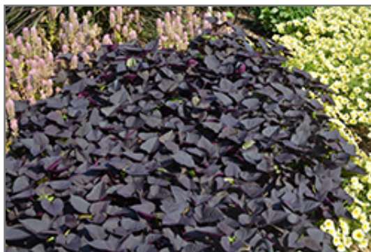
Sweet Caroline Sweetheart Jet Black Sweet Potato Vine

Sweet Caroline Sweetheart Jet Black Sweet Potato Vine is recommended for the following landscape applications;