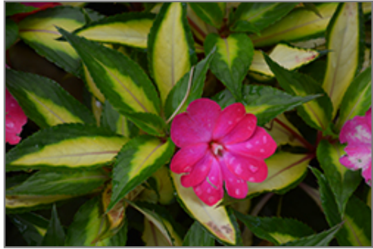
SunPatiens Compact Tropical Rose New Guinea Impatiens flowers