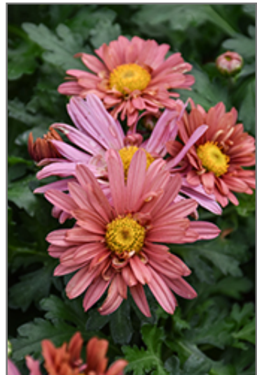
Coral Daisy Chrysanthemum flowers