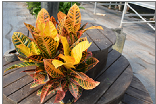
Variegated Croton