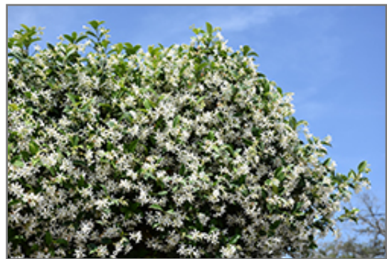
Madison Star-Jasmine flowers