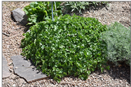
Sandia Coral Bells