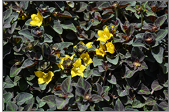
Midnight Sun Moneywort flowers

Midnight Sun Moneywort is recommended for the following landscape applications;